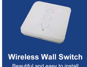
Wireless Wall Switch Beautiful and easy to install

Opening methods include buttons and remote controls which can open the door remotely.