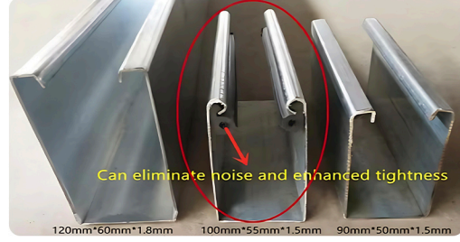
120mm*60mm*1.8mm 100mm*55mm*1.5mm 90mm*50mm*1.5mm

The track can be equipped with optional sealing rubber strips to effectively enhance the airtightness and sound insulation performance of the door body, which is suitable for places with high requirements for environmental control.